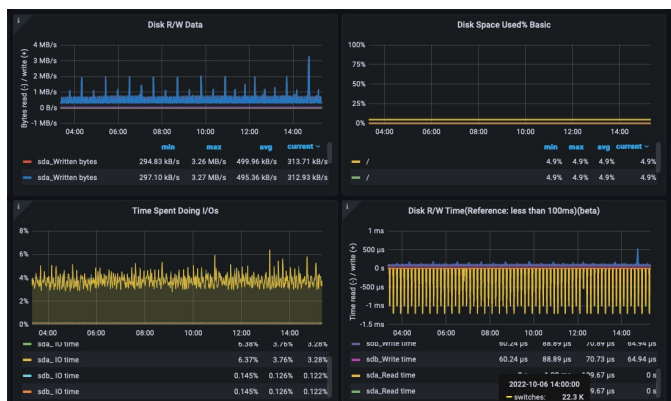
Fig. 2. Monitoring interface: the statistics

In this Section, we demonstrate the monitoring architecture of the CDN platform. As shown in Fig.2, the related statistics are represented in various type of charts. The operators of NCHC can easily obtain the information of all equipment in the system.